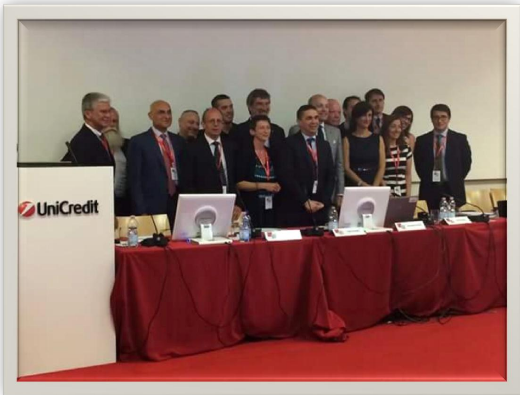
EWC Select Committee